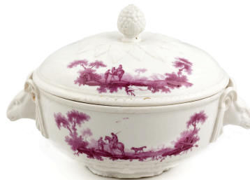
Ansbach/Hague, d. 1783