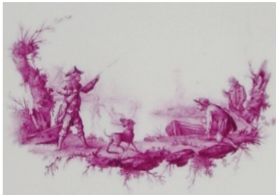
Detail-Loosdrecht plate (Rijksmuseum), c. 1783