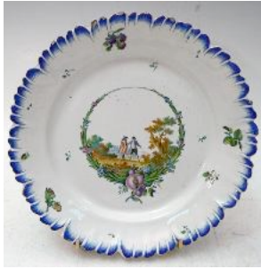
Sceaux faience, c. 1766-68