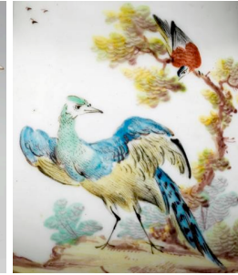
Sceaux porcelain, c. 1775