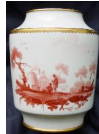
Neale (c. 1790)