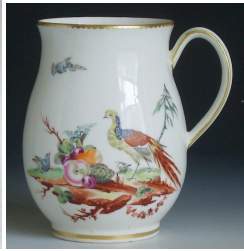
Chelsea-Derby, c. 1770