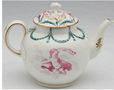
Derby porcelain, c. 1769-73